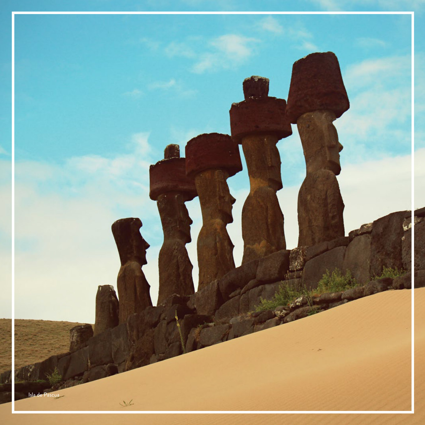
Isla de Pascua